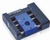
Compact translation stages

C-863.20C885 for up to 2 motion axes with DC motor or brushless DC motor: Variable travel range, maximum flexibility.