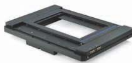
Multiaxis scanner for optical inspection