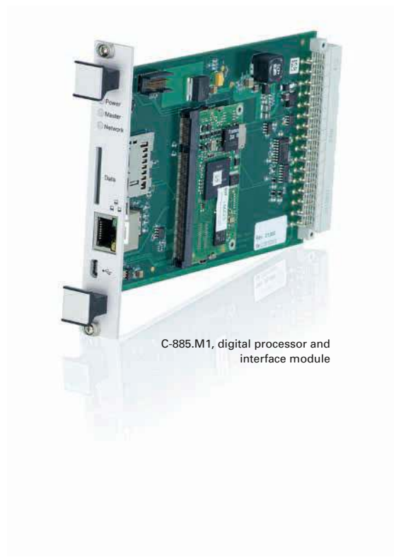
C-885.M1, digital processor and interface module