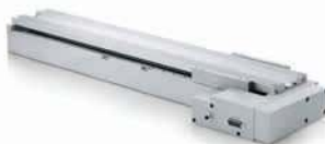
Linear axes with large travel ranges up to 1 m