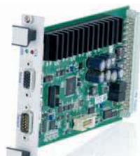
E-861.10C885 Motion controller module for NEXACT® piezomotor systems