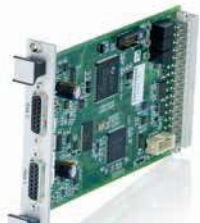
C-863.20C885 Motion controller module for DC motors