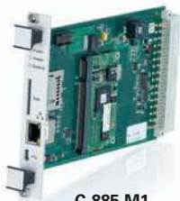
C-885.M1 Digital processor and interface module

MODULAR MULTIAXIS CONTROLLER SYSTEM FOR ALL DRIVE TYPES