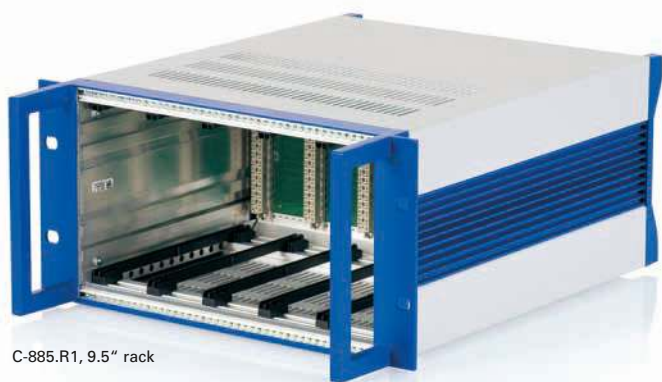
C-885.R1, 9.5" rack