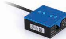
Dynamic linear stage