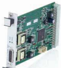
C-867.10C885 Motion controller module for PILine® piezomotor systems